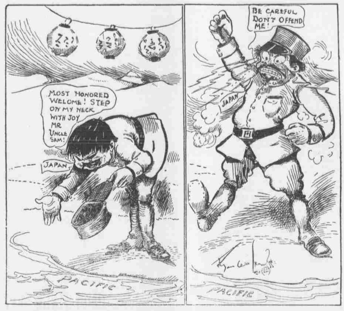
Attitude of Japan when our fleet was in the Pacific Ocean, and now when it is in the Atlantic Ocean