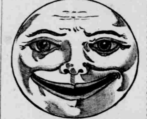
Will be wreathed with a most engaging smile, after you invest in a

White Sewing Machine EQUIPPED WITH ITS NEW PINCH TENSION, TENSION INDICATOR