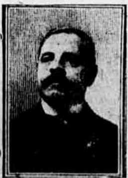
HON. FRANK W. HIGGINS, REPUBLICAN NOMINEE FOR GOVERNOR OF NEW YORK.

SARATOGA, N. Y., Sept. 15.—The Republicans in State Convention here today nominated F. W. Higgins as their candidate for Governor. The nomination was unanimous. Lieut. Gov. Woodruff withdrawing before the ballot.