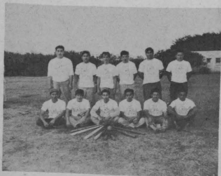
DOG CO. TEAM