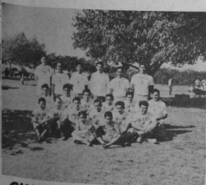
CHARLIE CO. TEAM

Charlie Co. forfeitted to Haeadquarters in the other game.