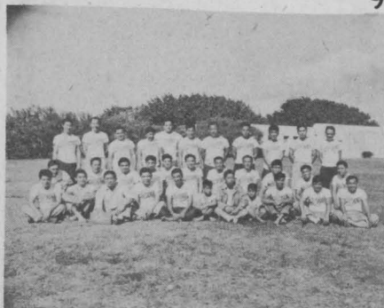
BAKER CO. TEAM

In a first round playoff game Dog Co. dropped Able Co. from the first round leadership by winning on a 15-9 score.