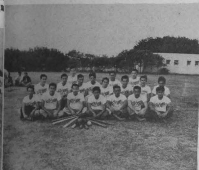
ABLE CO. TEAM