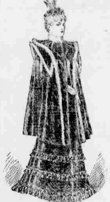
LILLIAN RUSSELL'S NEW COSTUME.