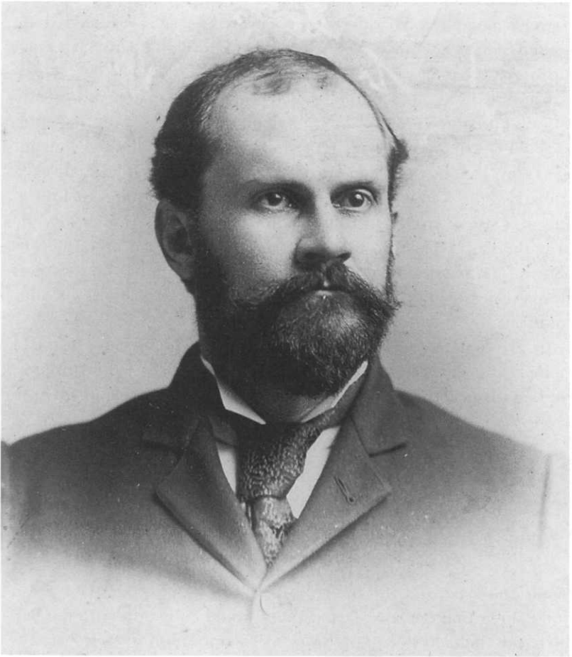
FIG. 2. Lorrin Andrews Thurston (1858–1931), as Provisional Government envoy to Washington after the 1893 overthrow, helped prepare the way for U.S. annexation of Hawai'i.

being landed to maintain order, remembering how his native Georgia had been occupied against the will of most Georgians after the Civil War.) Morgan also declared that restoration would violate U.S. preferences for republics over monarchies. As he put it,