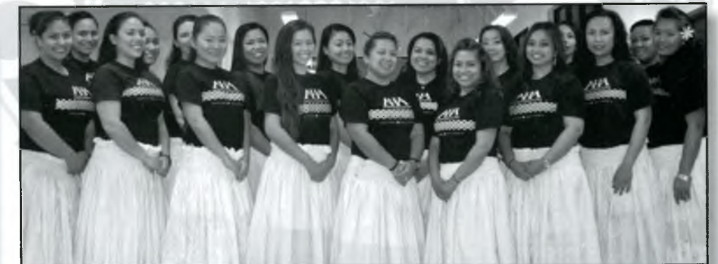
5. Academy of Hawaiian Arts