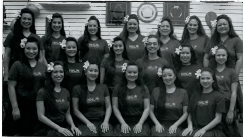
8. Hālau Hula Lani Ola