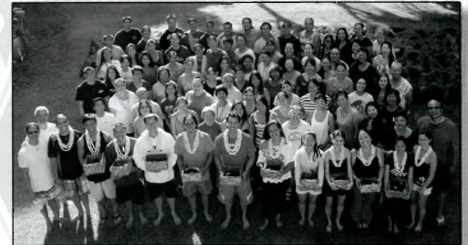
17. Hālau I Ka Wēkiu