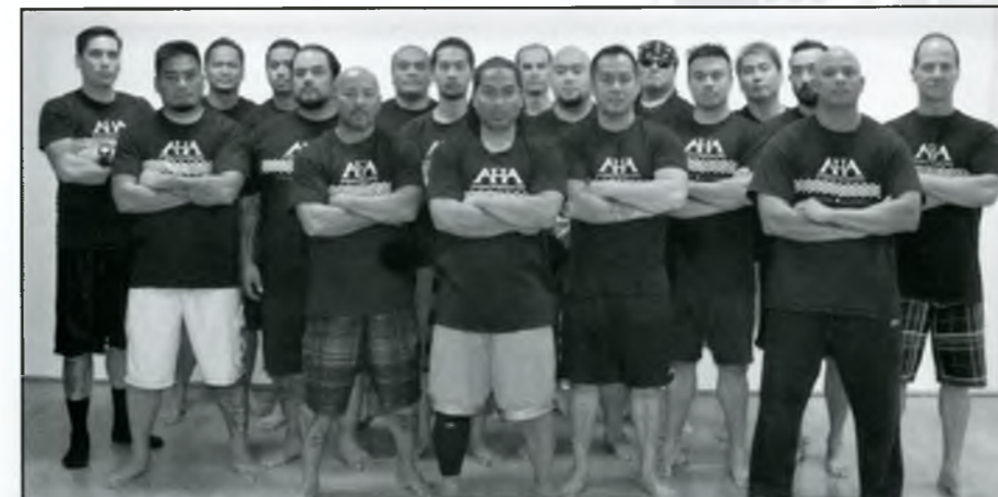
12. Academy of Hawaiian Arts