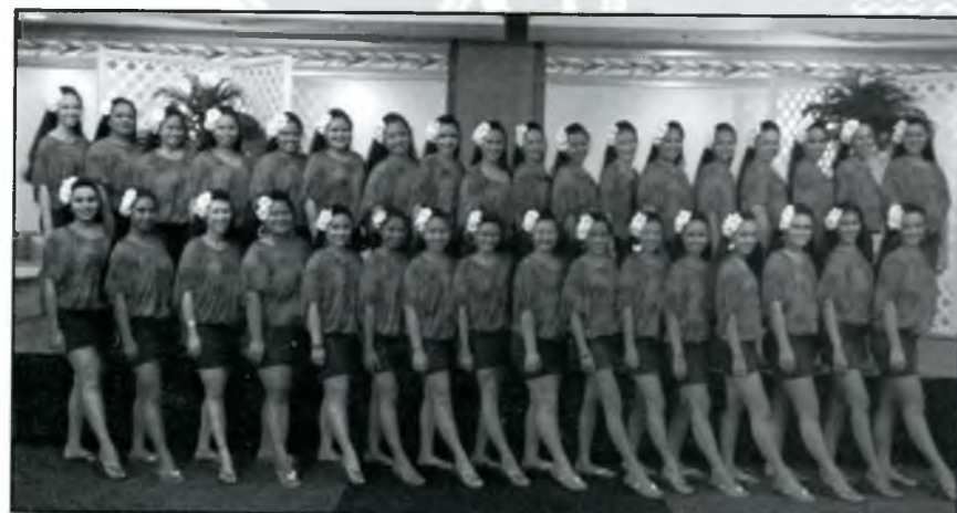
26. Hula Hālau 'O Kamuela