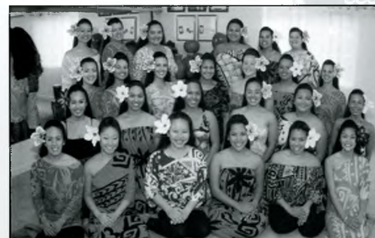
24. Ka Lā 'Ōnohi Mai O Ha'eha'e