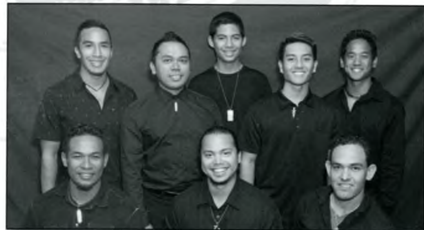
9. Hālau Nā Mamo O Pu'uanahulu