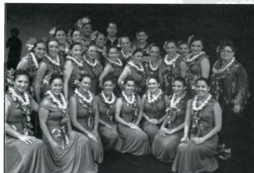
21. Keolalaulani Hālau 'Ōlapa O Laka