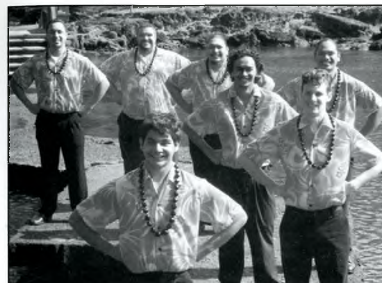
22. Hālau Hula 'O Kahikilaulani