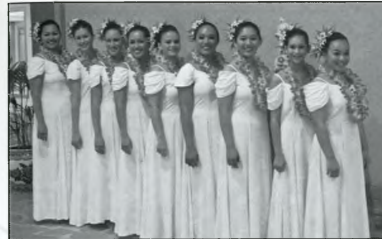
10. Beamer-Solomon Hālau O Po'ohala