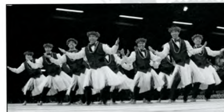
Kawaili'ulā Hula 'Auana winner

Kāne Overall Winner - Kawaili'ulā Wahine Overall Winner - Hālau Mōhala 'Ilima