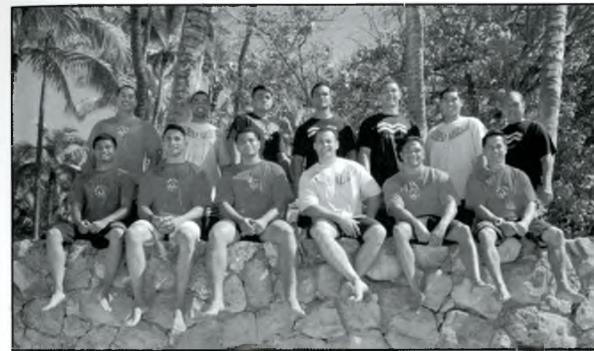
16. Ke Kai O Kahiki