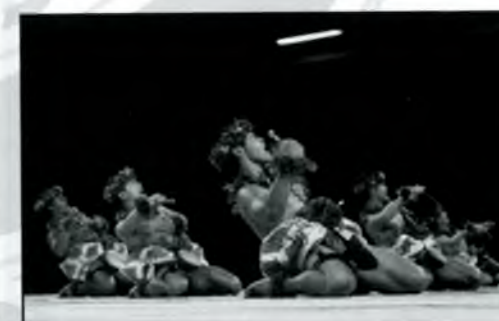
Kawaili'ulā Hula Kahiko winner