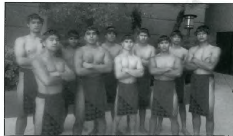
1. Nā Pua Me Kealoha