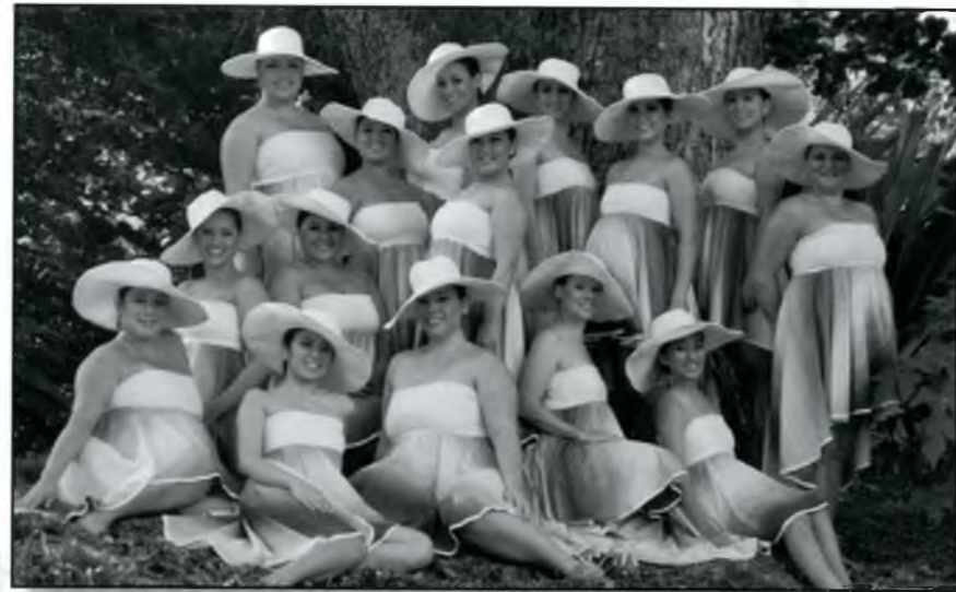
7. Hālau Hi'iakaināmakalehua