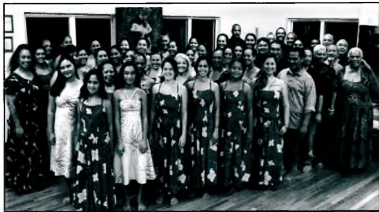
Hālau O Kekuhi