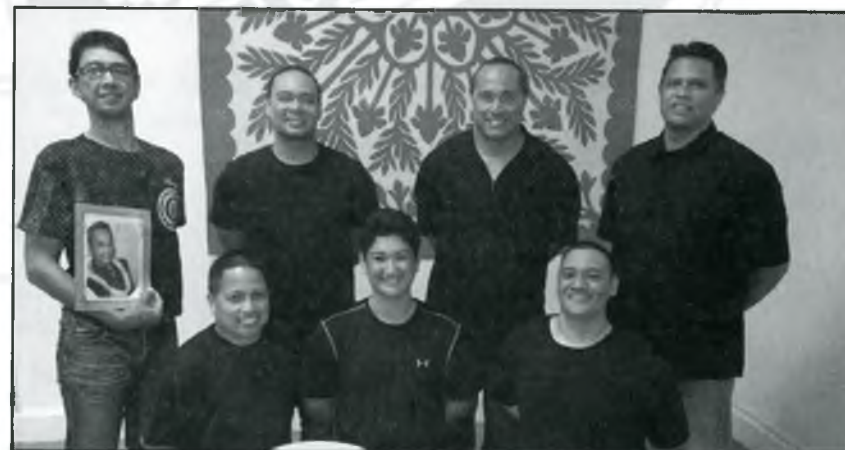
3. Keolalaulani Hālau 'Ōlapa O Laka