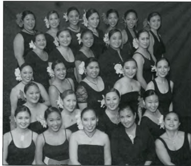
13. Hālau Nā Mamo O Pu‘uanahulu