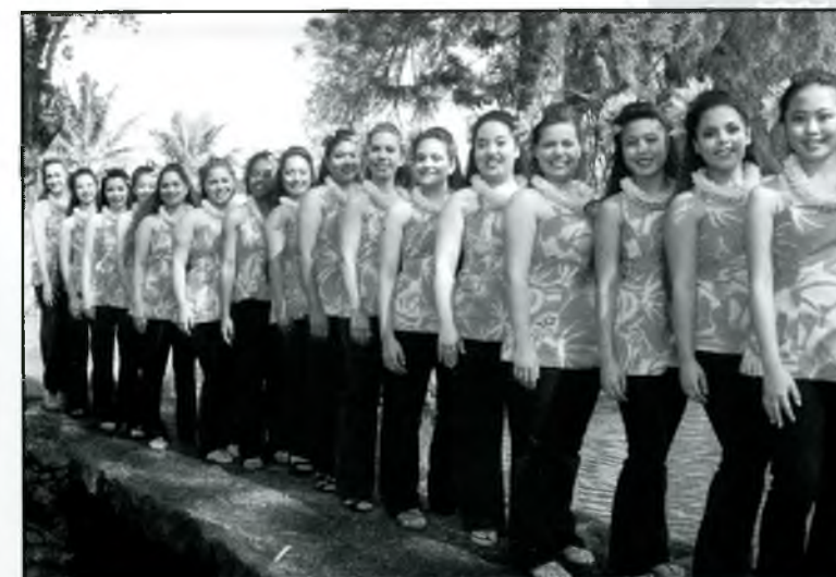
18. Hālau Hula ‘O Kahikilaulani