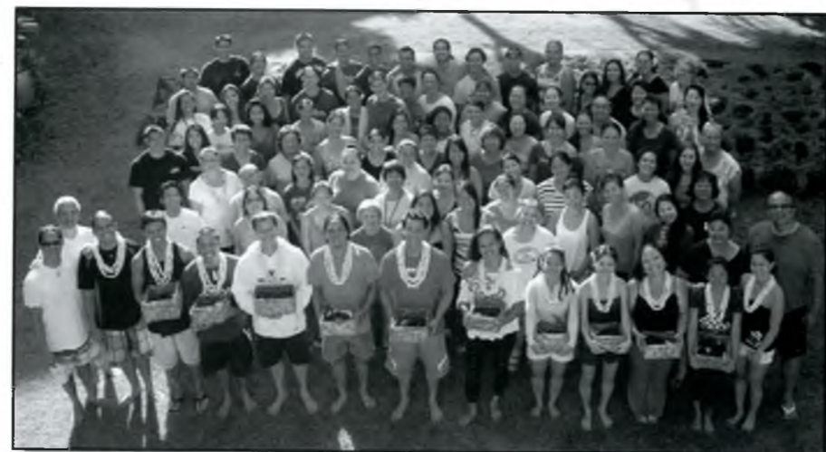
25. Hālau I Ka Wēkiu