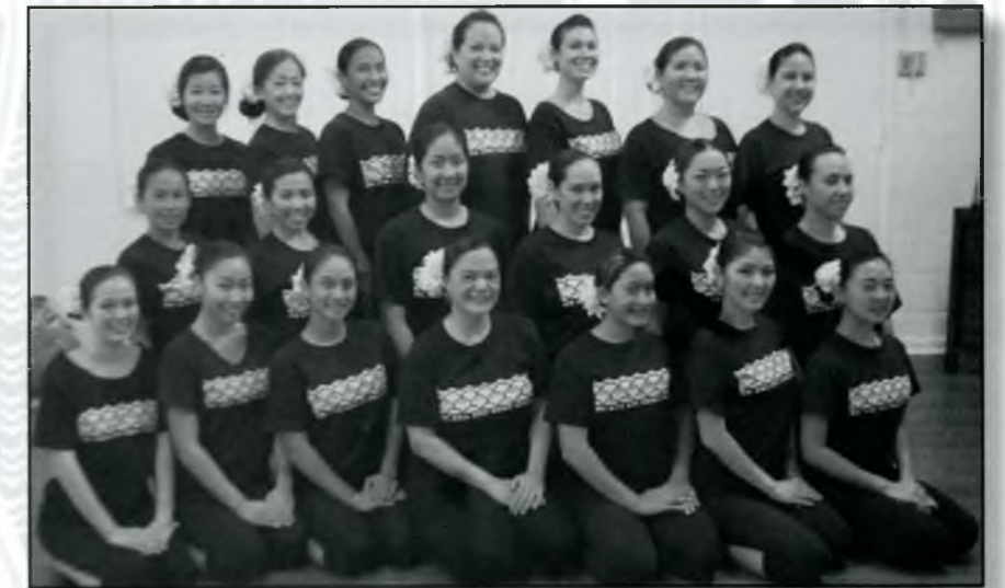
11. Hālau Hula Ka Lehua Tuahine