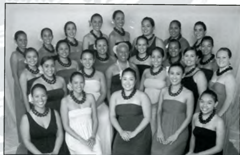
27. Hālau Mōhala 'Ilima