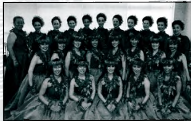
Hālau Nā Mamo O Kaleinani