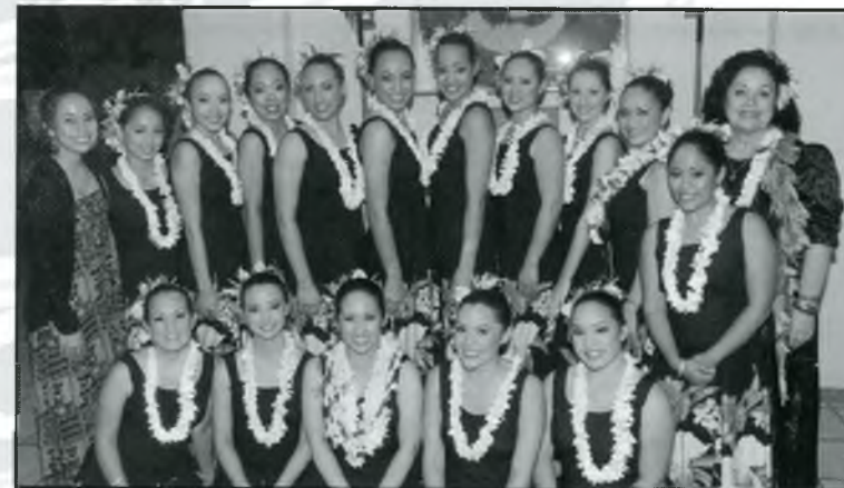
15. Hālau Hula Olana