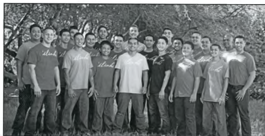
19. Hālau Kekuaokalā'au'ala'iliahi