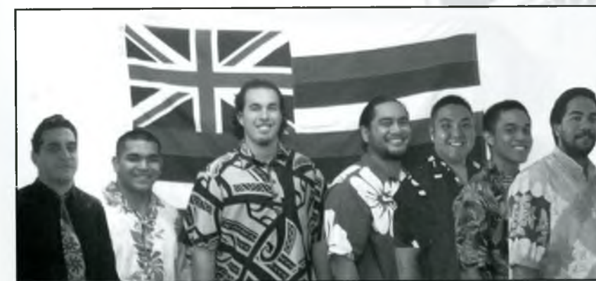
6. Hālau Ke Kia'i A O Hula