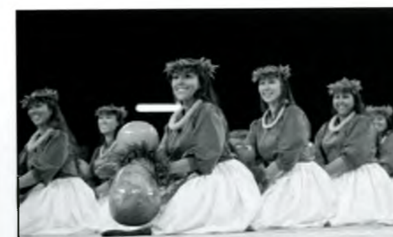
Hālau Mōhala 'Ilima Hula Kahiko winner