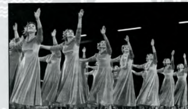
Keolaulani Hālau 'Ōlapa O Laka Hula 'Auana winner