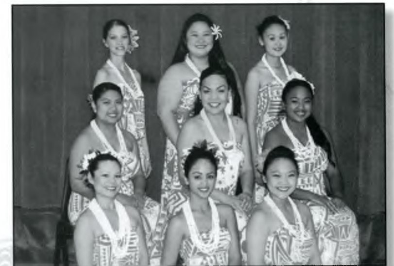
4. Hālau Hula 'O Hōkūlani