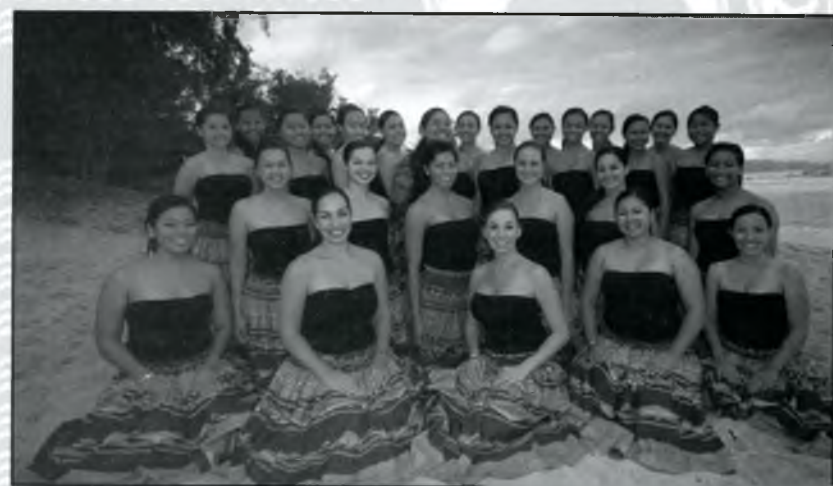
20. Hālau Nā Lei Kaumaka O Uka