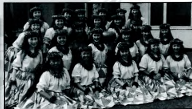
Hālau Hula O Mehanaokalā