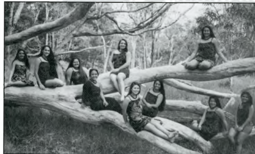
2. Hālau Nā Lei Hiwahiwa O Ku'ualoha