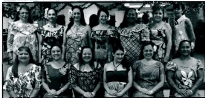
'Ilima Hula Studio & Family