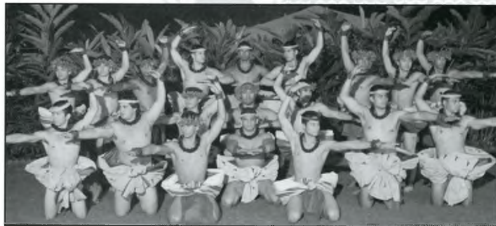
14. Ka Leo O Laka I Ka Hikina O Ka Lā