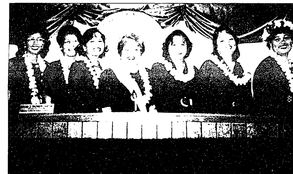
Third Northern Marianas Constitutional Convention