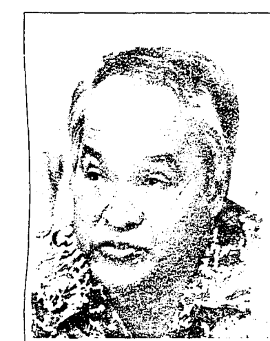
Froilan C. Tenorio

To make sure that the governor will this time be amenable to an extension, the House and Senate passed H.B. 10-173 but without the provision prohibiting hiring through manpower recruitment firms.