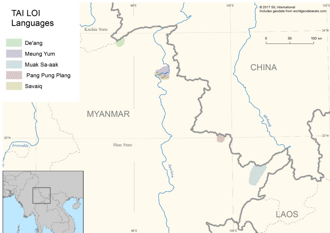
Figure 2: Locations of groups referred to as 'Tai Loi'.