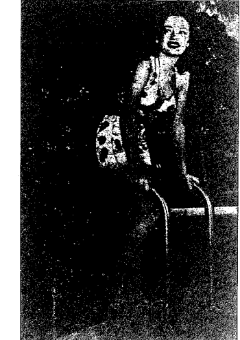
JANE GREER, RKO's best bet, has been voted Queen of Glamour by U.S. press photographers. Jane went out over such beauties as Ava Gardner and Rita Hayworth. Here, she is doing away with a rigorous set of daily exercise at a typical Hollywood swimming pool.

Russia's 2,325-mile Volga river is the longest in Europe.