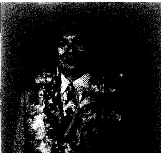
SENATOR FEARS ALL OUT WAR