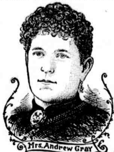
La Crosse, Wis.

"I shall write to my friends in Christchurch and recommend Hood's Sarsaparilla to them. We also lived in Port Lyttleton