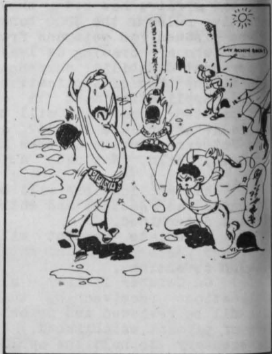
THE ROCK PILE OF NORTH AFRICA by GABBY TAKAMOTO

YOSHIO TAKENOCHI recently underwent an eye operation. "Joe" is up and around again and fully recovered from the ordeal.