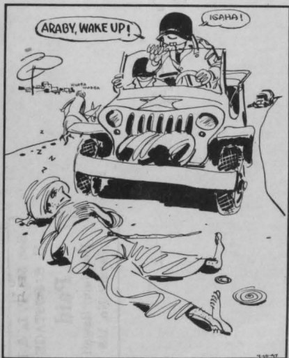
THEM-RABS CAN SLEEP ANYWHERE

The ten best sellers are slated to be feted to a chop sui dinner as guests of the Oahu Chapter. Time and place will be announced later.