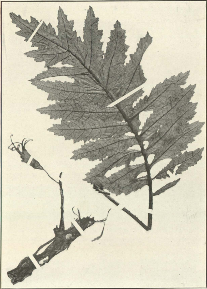
CYANEA GRIMESIANA CYLINDROCALYX Rock