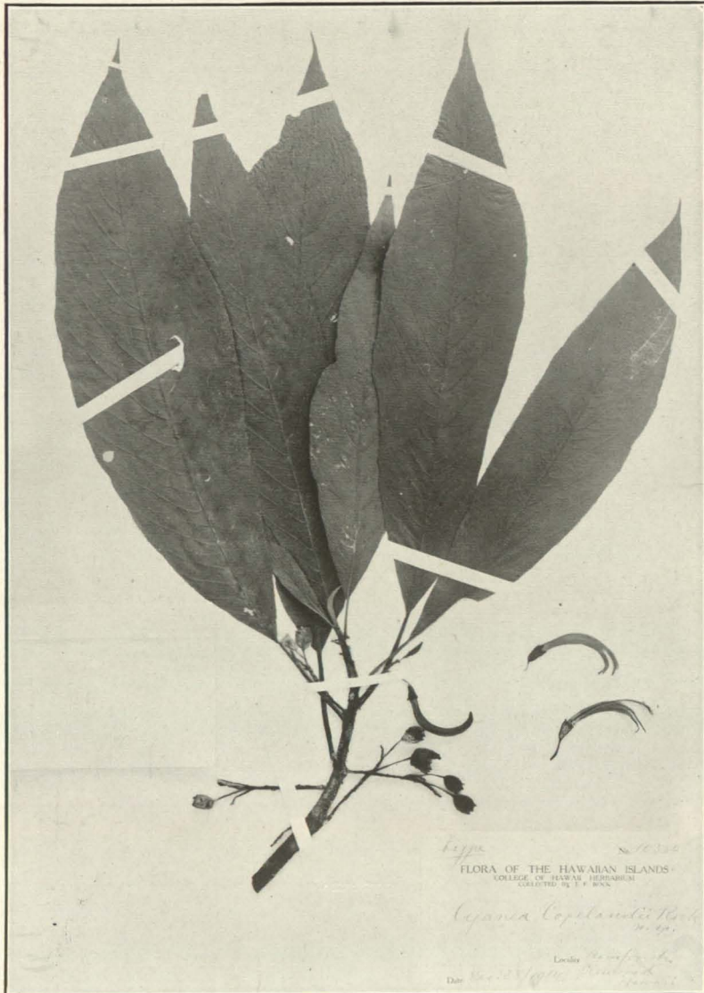
CYANEA COPELANDII ROCK