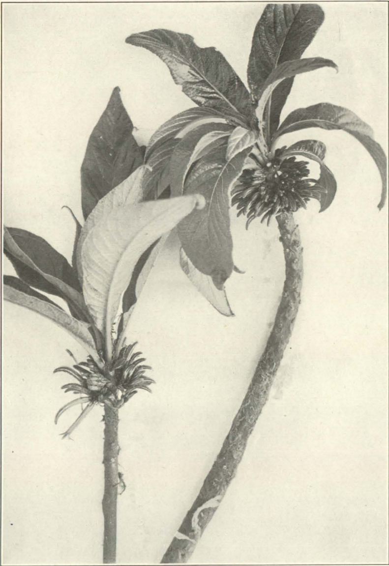
CYANEA BISHOPII Rock