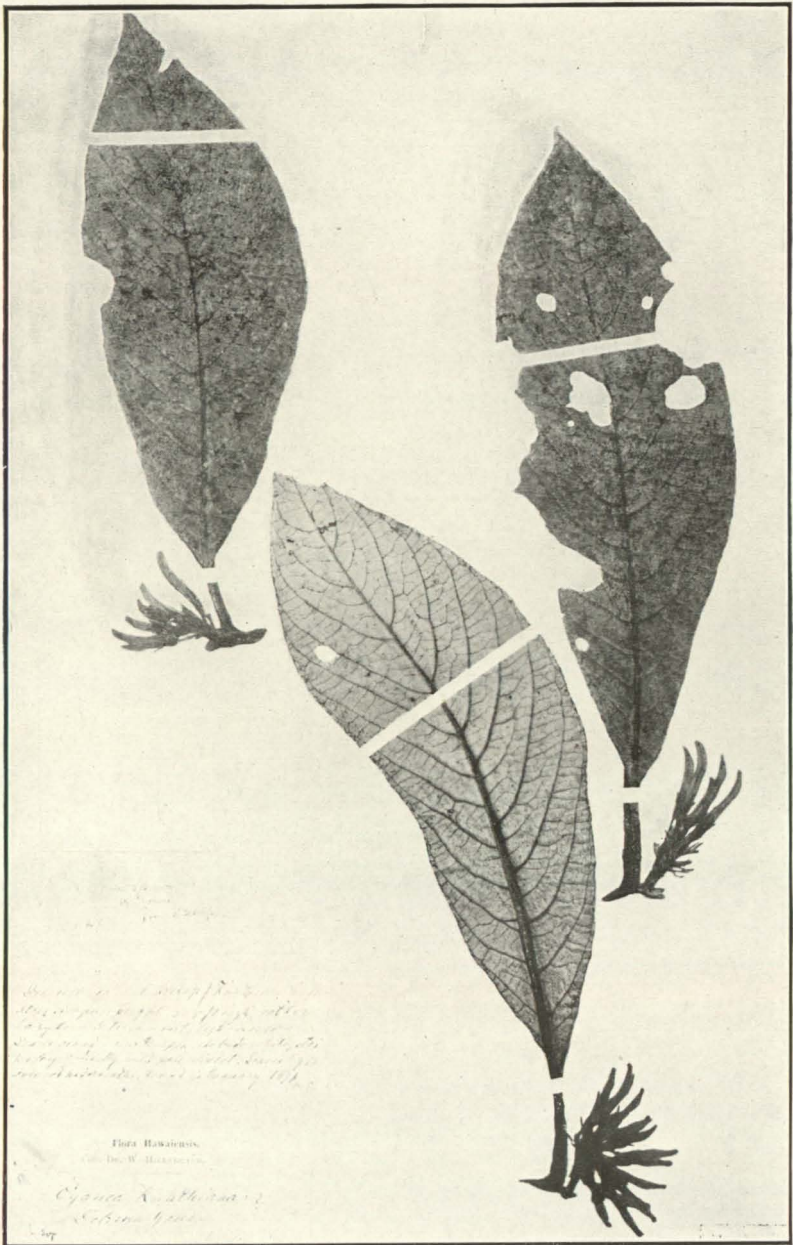
CYANEA BISHOPII Rock