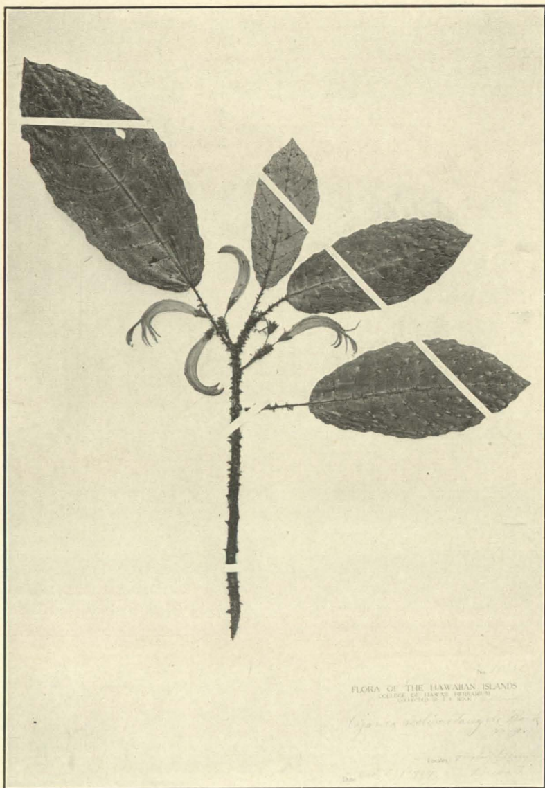
CYANEA NOLI-ME-TANGERE Rock