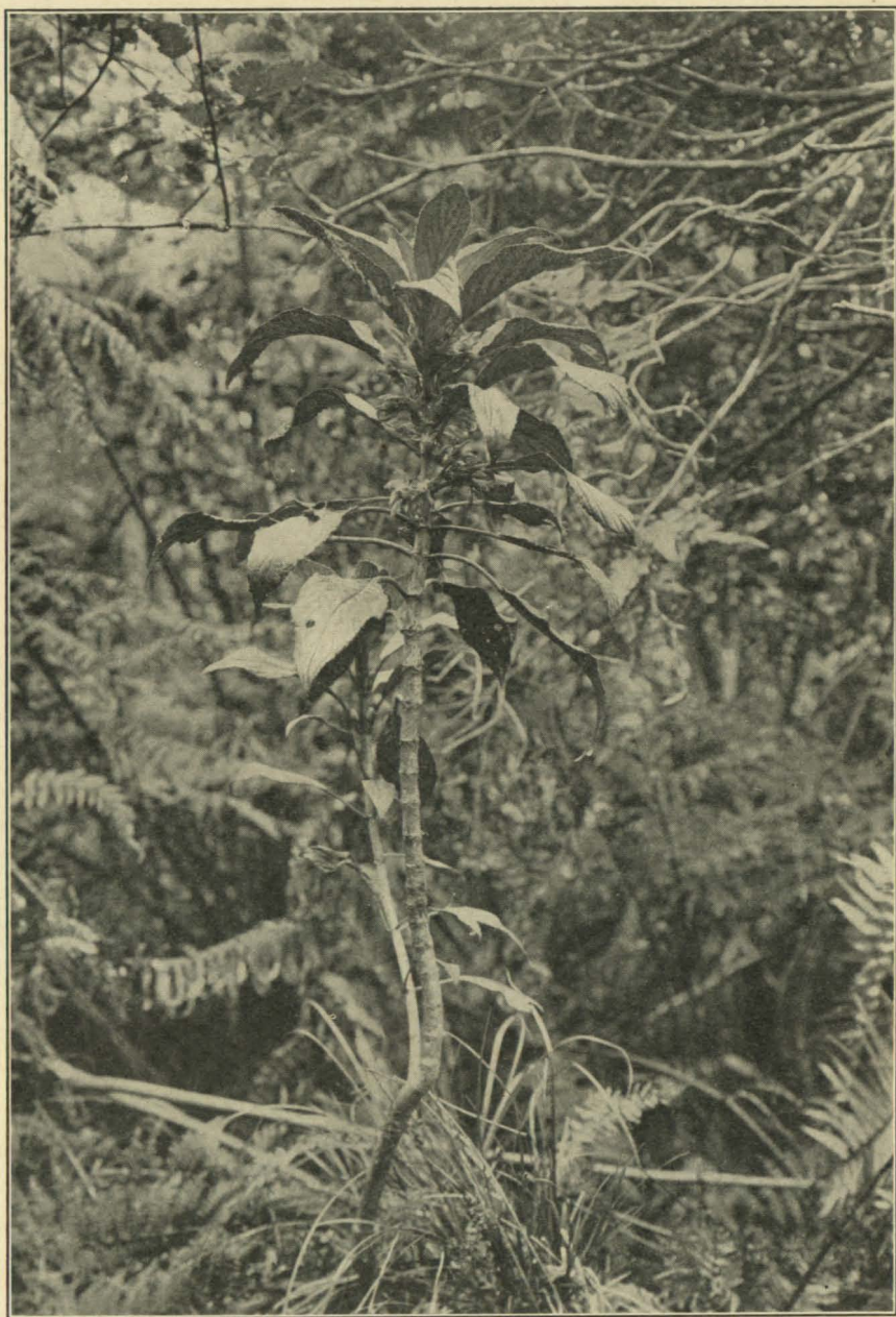
ROCK: TYPE OF CYRTANDRA MONTIS LOA ROCK, GROWING IN THE FORESTS OF KULANI, SLOPES OF MAUNA LOA, ELEVATION 5,000 FEET, HAWAII.