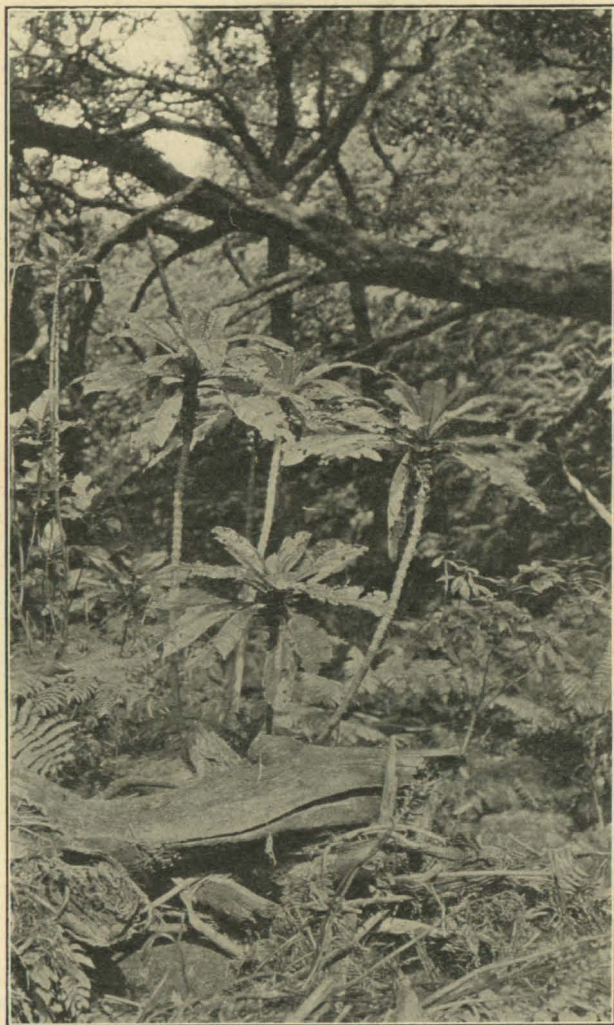
ROCK: CYRTANDRA LIMOSIFOLIA ROCK, GROWING IN THE STREAM BED OF MAPULEHU VALLEY, MOLOKAI.