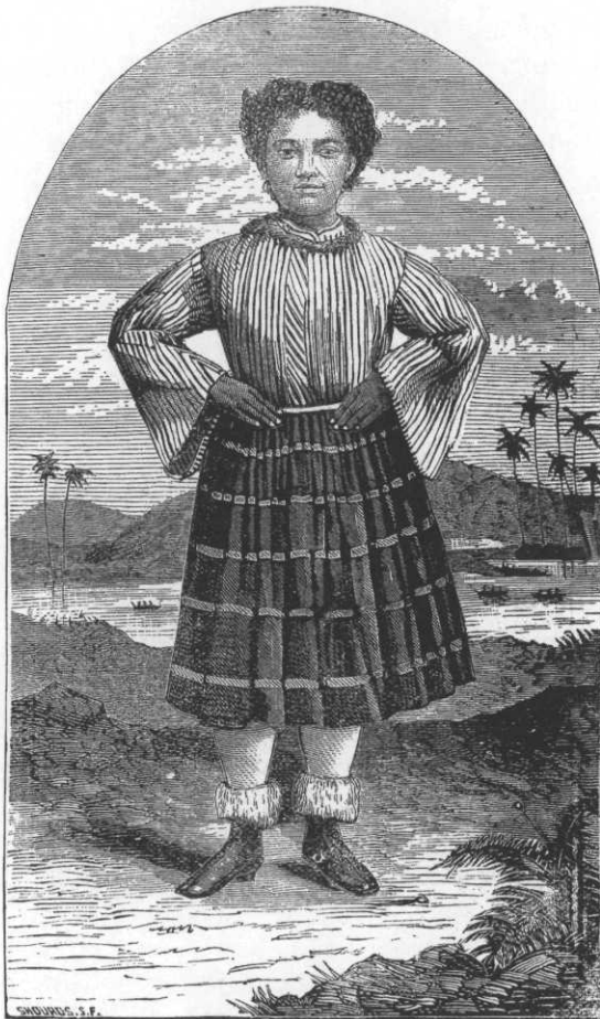
HAWAIIAN DANCING GIRL.

the former president of the Republic of Hawaii and the first territorial governor, was not on message. Perhaps images of the bustling metropolis of Honolulu were difficult to obtain in the early months of 1900. The Board of Health was fighting the bubonic plague, and by setting fire to the Chinese and Hawaiian part of the city and burned about 40 acres. Instead the report was illustrated exclusively with