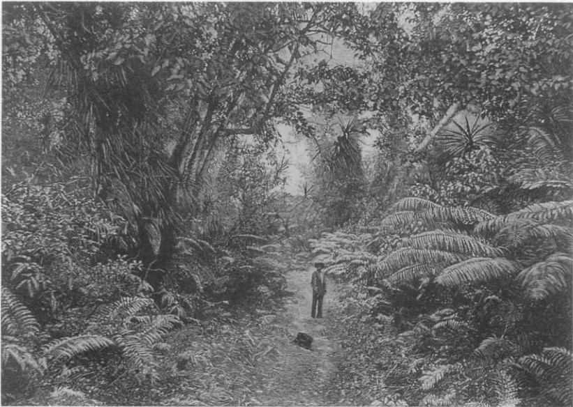
FIG. 10. “Forest Scenery—Puna,” from Hawaiian Volcanoes by Clarence Edward Dutton, 1884.

“The views of the Islands are as fine as the pineapples. And of all the views none surpasses this one known as ‘Nuuanu Pali.’ The camera identifies it for you as a thumbprint identifies a man. This picture is far from the view itself. Only your eye can take it in. Thousands have thought it worth the trip to the Islands.”