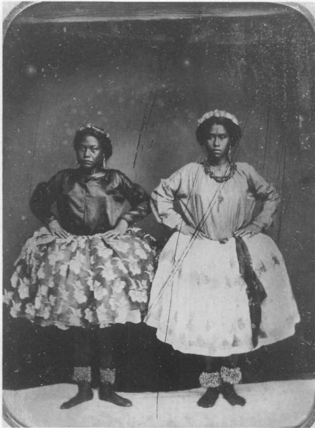
FIG. 4. Hula Dancers, ca. 1856, Ambrotype.

The establishment of permanent military bases on O'ahu, including a United States Navy base at Pearl Harbor in 1908 and an Army base at Schofield Barracks in 1909, coincided with the increased dis-