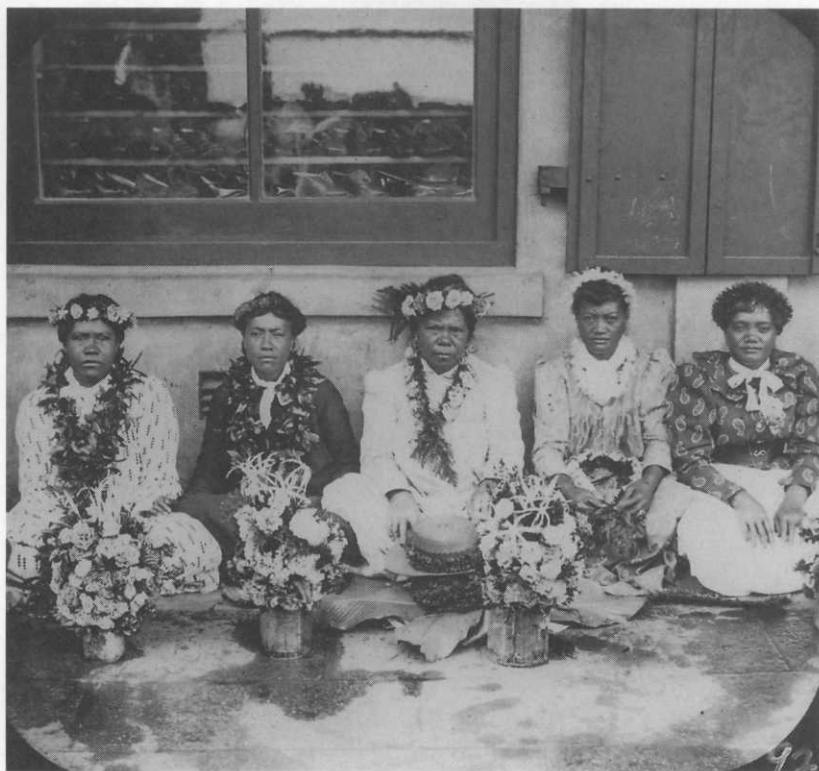
FIG. 3. Lei Sellers, Honolulu, ca. 1890.

By the 1880s, during the reign of Kalākaua, hula was performed at public events, including the coronation (1883) and the king's birthday celebrations. Although hula groups went to studios to pose for pictures following performances, few of the images were published in the nineteenth century. Visitors collected these images as "curiosities" for their souvenir photo albums. A series of photographs of Ioane