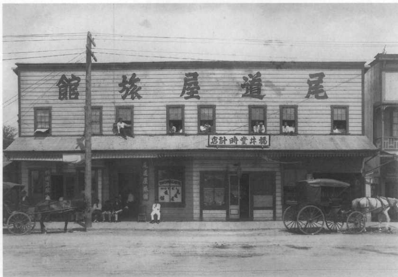
FIG. 9. Usaku Terragawachi, Hotel, Honolulu, ca. 1920. Bishop Museum.

This bibliography is by no means comprehensive. 12 I have included published materials that made extensive use of photographs. I have not included magazine articles, except for two prominent issues of National Geographic devoted to Hawai'i. Some of the citations include