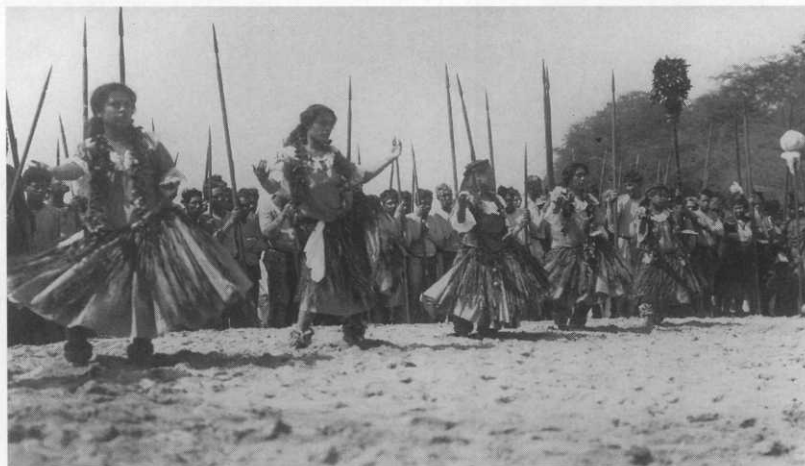
FIG. 7. Hula performed for reenactment of the landing of Kamehameha at Waikiki, Floral Parade, February 22, 1913.