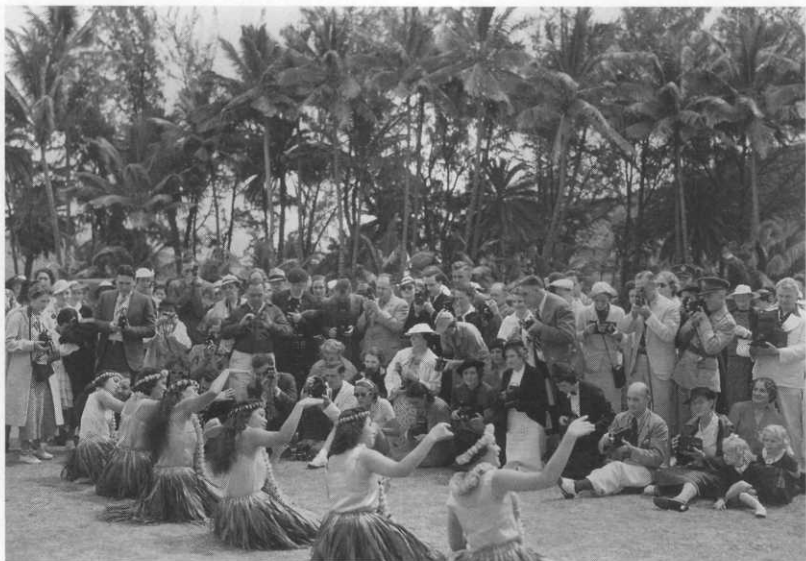
FIG. 8. Nathaniel Farbman, Kodak Hula Show, Waikiki, Hawai'i, 1937. Bishop Museum.

Books describing Hawai'i were also written and published in Japanese. Japanese people had been routinely brought to the islands as laborers for the sugar plantations since 1885. The publications were targeted to new immigrants who needed to know about the living conditions in the islands, as well as changing immigration laws resulting from annexation. Although these publications seldom credited photographers, the majority of the images were the work of Japanese photographers who established photo studios throughout the islands beginning in the 1890s. There were 20 Japanese photographers