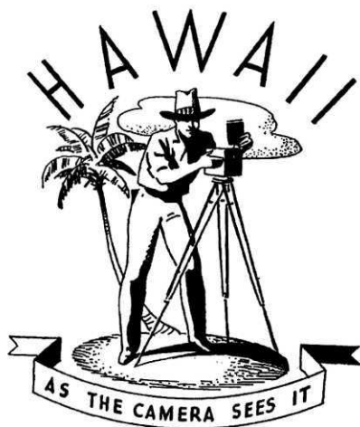
FIG. 13. Frontispiece, Hawaii as the Camera Sees It , October 1934.

This pictorial publication had six editions and numerous printings between 1933 and 1942. The first edition, the only one edited by Welty, was published in February 1933. The cover illustration was of Aloha Tower. The book included Hawaii Tourist Bureau maps. The second