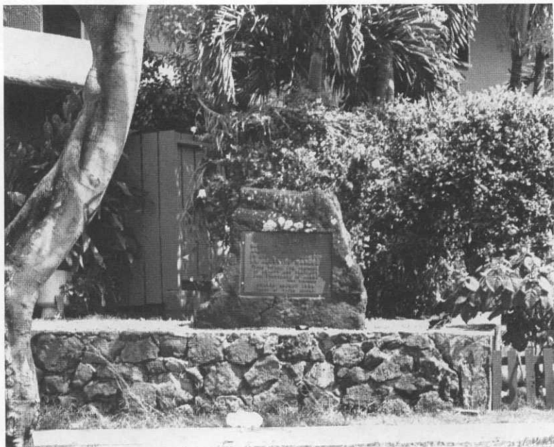
FIG. 3. Artesian well monument on Wilder Avenue, Honolulu.