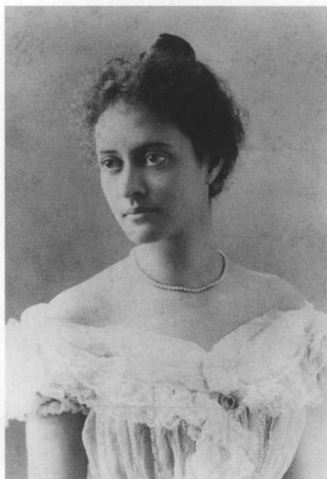
FIG. 1. Princess Victoria Kawekiu Ka'iulani Lunalilo Kalaninuihiamaha Cleghorn, 1875-1899.