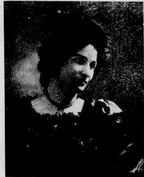
AS HE MAKES UP.