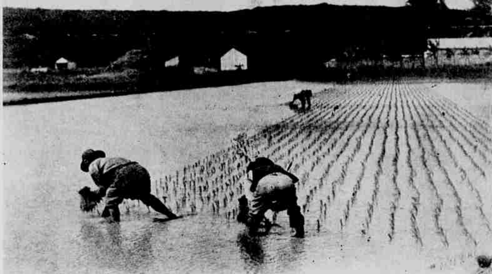
Rice Transplanting near Honolulu.