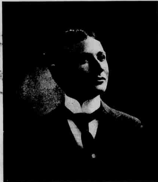
AS HE IS.