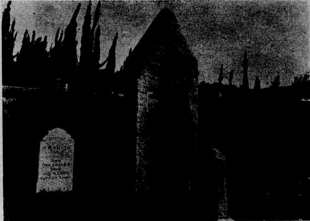
This is the monument erected to the memory of Jules Tavernier, one of the artists of the fin de siècle . He did his last and best work in these islands, where he died and where he was buried. He alone transferred the grandeur of Kilauea to canvas and gave to the world the only faithful picture of Hawaii's natural wonder.

Lo! as he (the sick man) gazed upon the flowers the scenes of his boyhood returned in panoramic succession. Roaming in the forest and the wild glens, lying on the sweet sented fern clumps by the murmuring brooks, under the roar of the waterfall, with wild flowers all around; or, the scene at early sunrise, when the luminous orb of day peeps over the eastern horizon streaking with radiating rays the eastern sky, and awakening the somber shadows on the distant low-capped mountain, changing the tints, first to a pale delicate blue; then, as the sun rose, to a faint but glorious pink tint, glossy as the finest silk, that chased away the