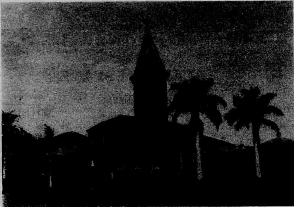
LUNALILO HOME, HONOLULU.