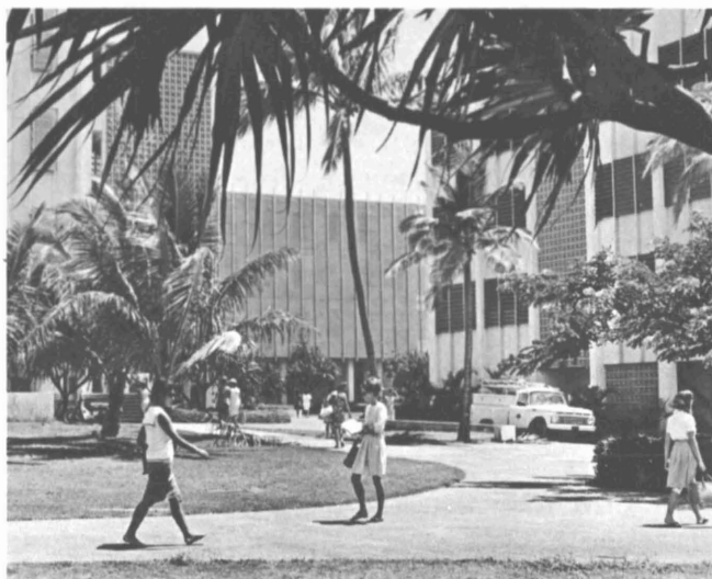
Classrooms, research labs adjoin on Manoa campus

GRADUATE SCHOOL OF LIBRARY STUDIES. The program of the Graduate School of Library Studies was initiated in the 1965 summer session. Students wishing to work for the Master of Library Studies degree should study the catalogue of the School and follow the admission procedure described therein. For application forms, write to: The Office of the Dean, Graduate School of Library Studies, University of Hawaii, Honolulu, Hawaii 96822. The completed forms, transcripts, and letters of reference should be mailed to the same office. For those wishing to enter the program during the 1966 summer session, the foregoing documents should be transmitted by the beginning of June.