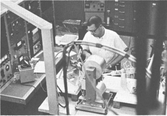
Scientist at work in geophysics institute laboratory