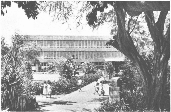
Gregg M. Sinclair Library