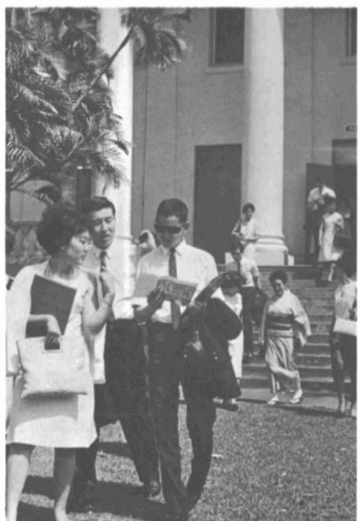
Left, students tour the campus; right, a painting class