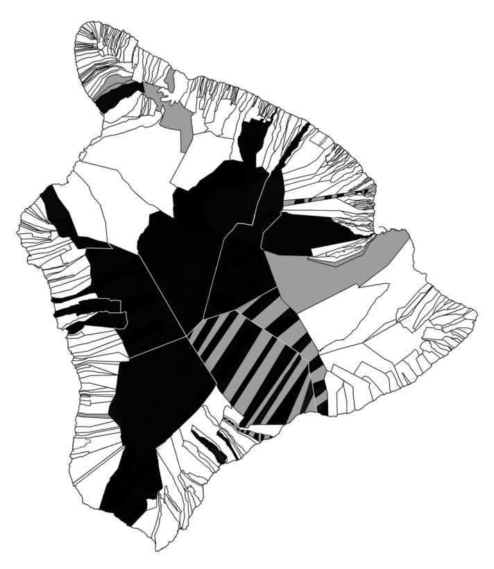
FIGURE 1 Bird Catching Ahupua'a of Hawai'i Island

The following map shows the ahupua'a distribution of bird species hunted on Hawai'i island according to data from the testimonies.<sup>14</sup>