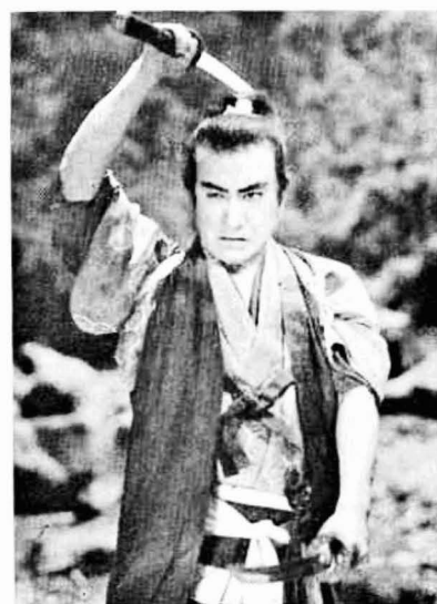
(14) Chiezo Kataoka, star of his- torical "sword-fighting plays"