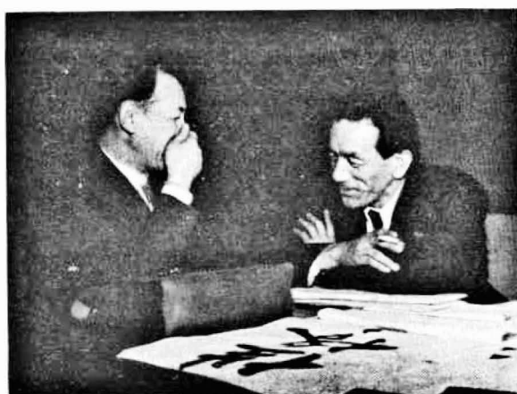
(13) Directors Tomu Uchida (left) and Yasujiro Ozu (right)