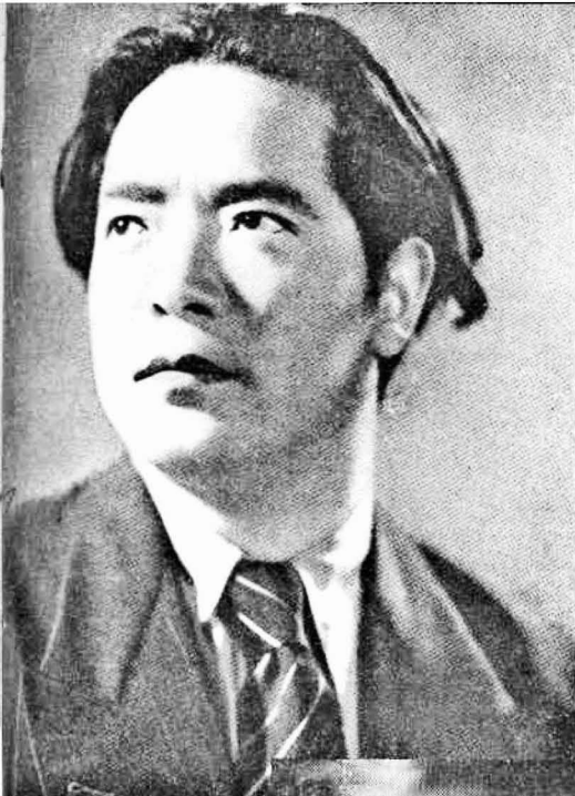
(1) Isamu Kosugi, famous actor of modern parts