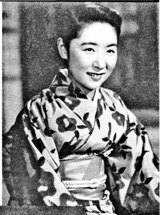
(2) Kinuyo Tanaka, star tragedienne