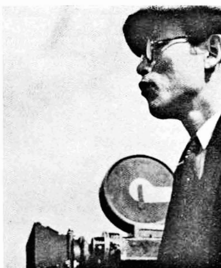
(16) Director Tomotaka Tasaka, also a progressive producer