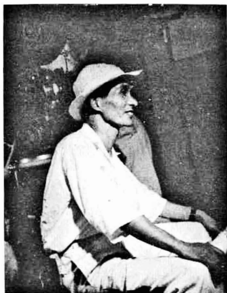
(15) Director Shiro Toyoda, a leader of the reform movement