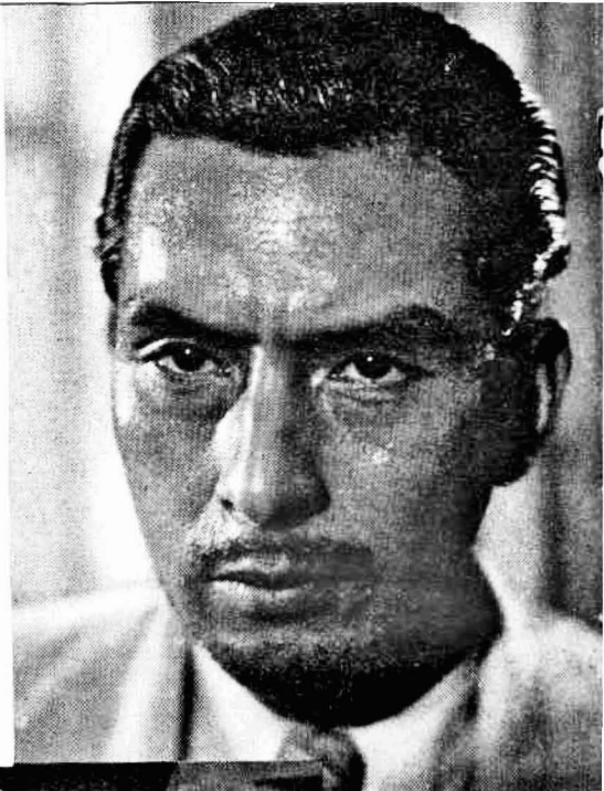
(7) Ken Uehara, Japanese matinee idol