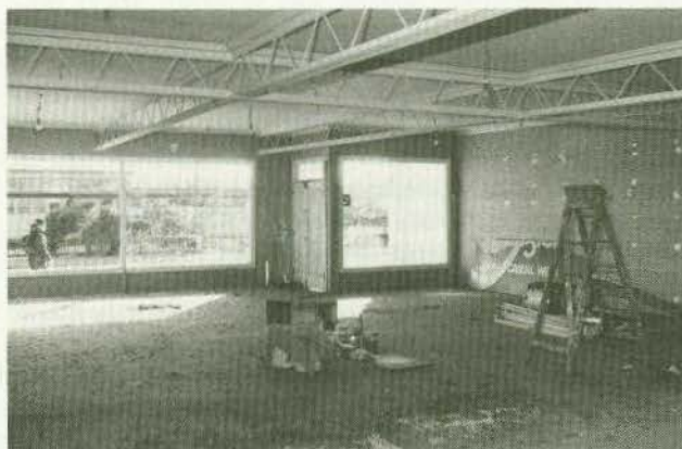
Three weeks before opening day: Aue! Taukiri e!

The carvings are very distinctive in their construction and colouring. Traditional Maori carving follows certain styles and conventions, is usually done in totara, and the finished product is either stained or painted an ochre or dark brown colour. These ones are carved into customboard, unbelievable though it may seem, and a three-