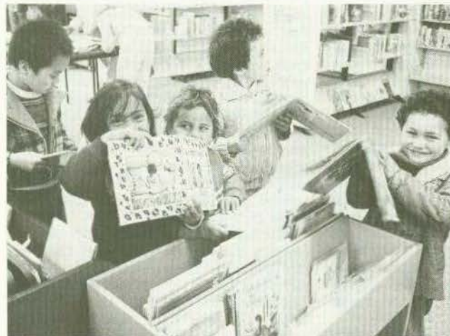
A few of the many children who are the predominant users of the Cannons Creek Library

Are you getting the idea now? The possibilities are endless. There is one killer-phrase, however, which has been sufficient for decades to send Pakeha librarians interested in improving their services to all groups within their community scuttling back into mediocrity. That phrase, and I have had it thrown at me by comfortable, middle-class Pakeha who are committed to maintaining the monocultural flavour of their libraries