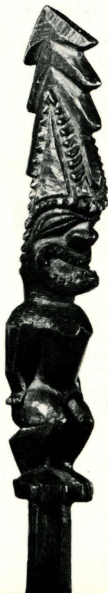
Akua ka'ai , Hawaii collected 1825 Academy Purchase, 1962 on view in reinstallation of the arts of Hawaii in Gallery 27

The first section of the Academy's new gallery for the traditional arts of the Pacific, Africa and the Americas is open. The installation covers the ancient art of Hawaii and includes feather capes and leis, lei niho palaoa, carved god figures, kapa and kapa-making equipment, decorated gourd containers, wooden bowls and other items of daily use such as tools and utensils. Much more material is now on display than was shown previously, and many of the objects have not been on view for several years. Work is progressing on the other sections of the gallery and these will be opened as installations are completed.