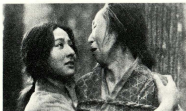
The Bailiff by Kenji Mizoguchi see March 14