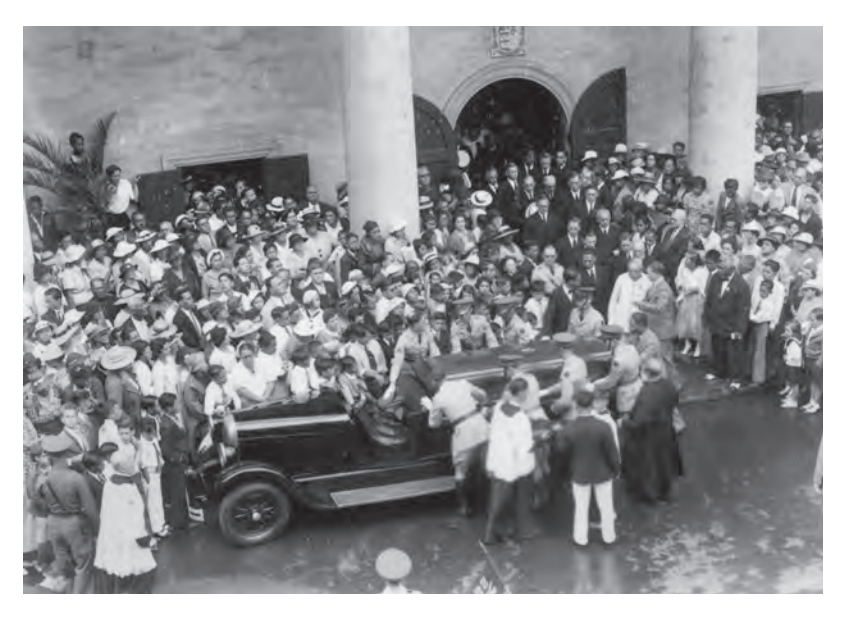
Fig. 5. Father Damien's remains leave the Cathedral of Our Lady of Peace in Honolulu to be conveyed to the Army transport ship the USS Republic , February 3, 1936.