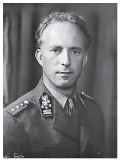
Fig. 2. King Leopold III of Belgium, 1950. Encyclopedia Britannica Inc.