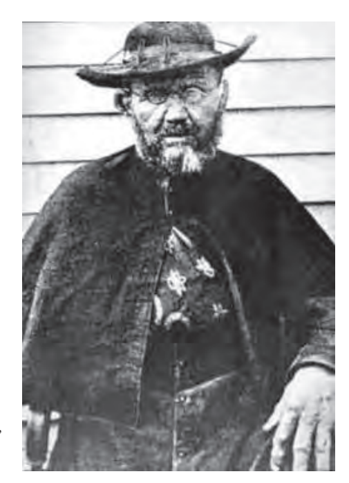
Fig. 3. Father Damien De Veuster, 1889.