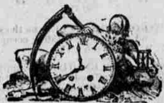
Always on hand a nice stock of