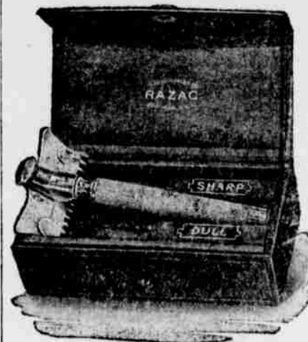
NO. 12.—STANDARD RAZAC SET.

Triple silver-plated holder and twelve double-edged blades, genuine leather case.....$3.50 Same as above—quadruple gold plated. 6.50 Blades, $1 per dozen. Set blades rehoned, 25.