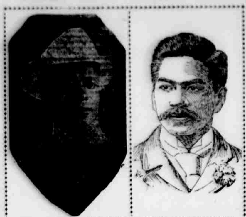
ERNEST HOGAN AND PRINCE JONAH KALANIANA'OLE