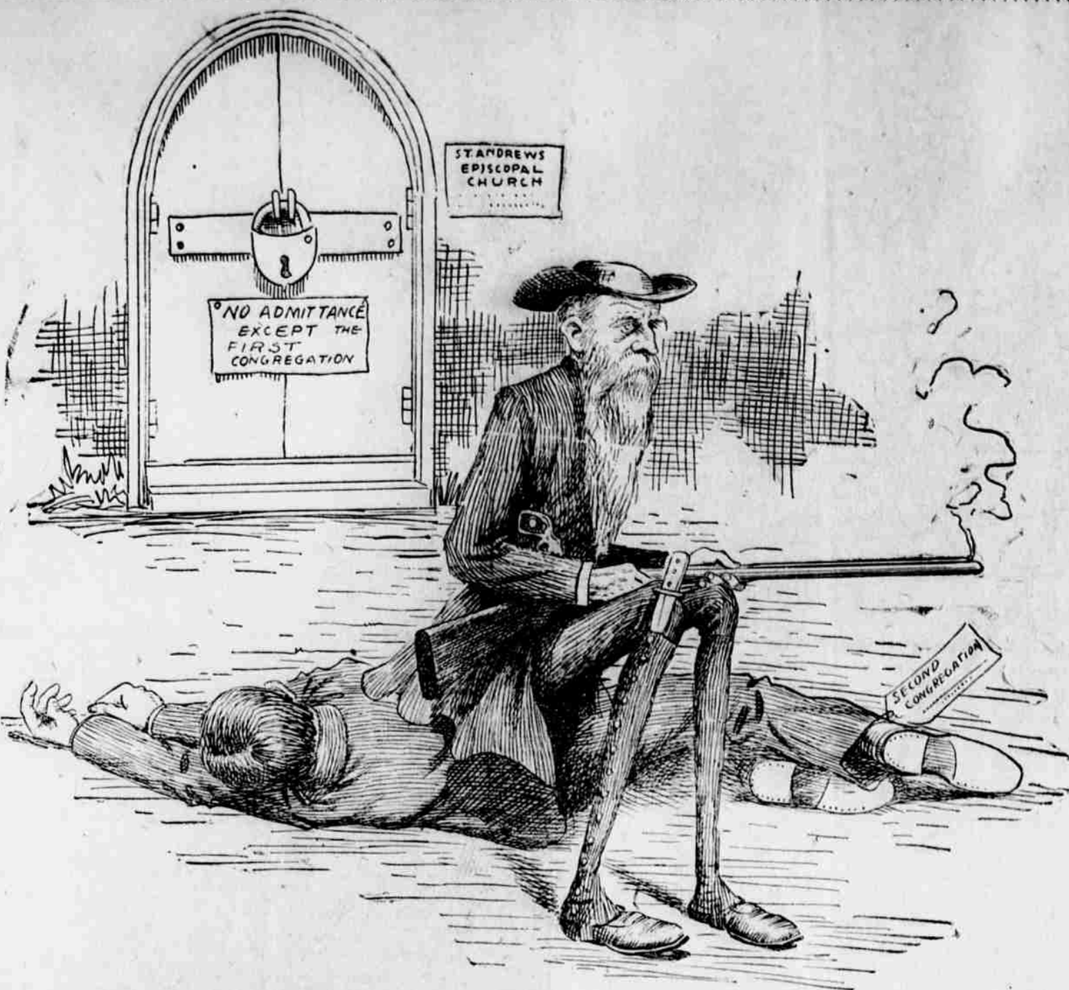
HOW THE BISHOP OBSERVES LENT.