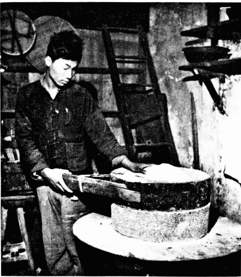
The pattern of this mill which turns rice grains into rice flour has not been changed in China for 3,000 years. Walking around it in endless revolutions the man turns the heavy millstone