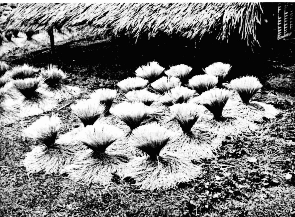
J a v a

Like ballet dancers the golden sheaves of rice stand in the sun