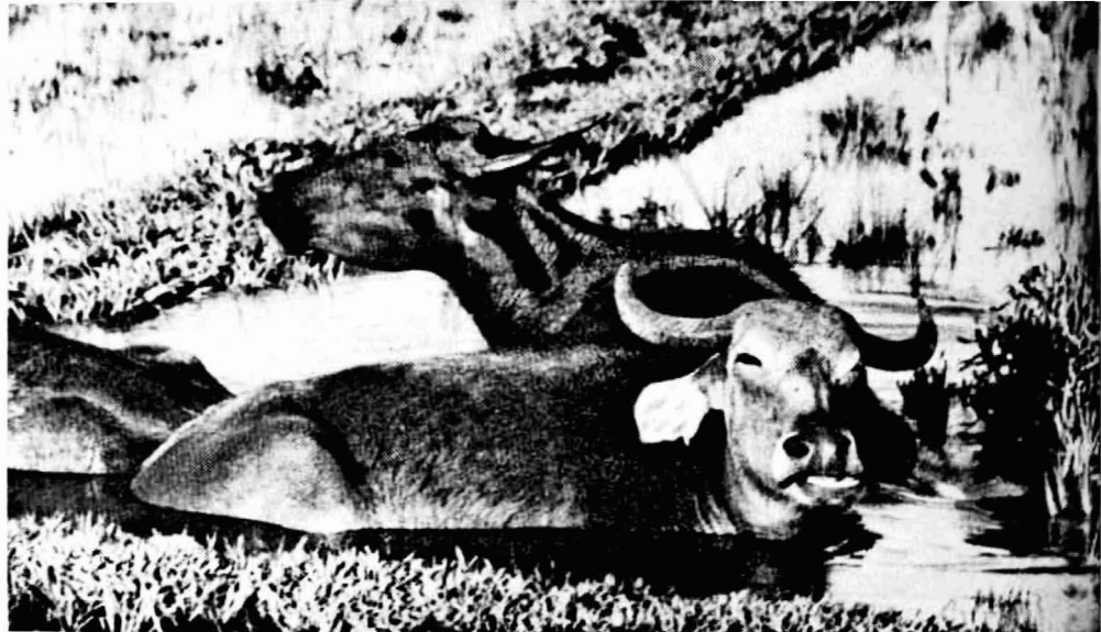
"Living Manure." For months before the rice is planted, water buffaloes are allowed to wallow all day in the flooded fields

Curry and rice for the children of laborers. The law in Ceylon provides that the plantation owner must give one free meal a day to the children of his workers