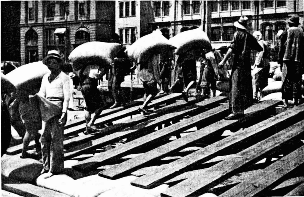
Rice being carried from native craft into the storehouses of the big city