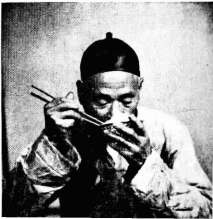
His daily bowl of rice