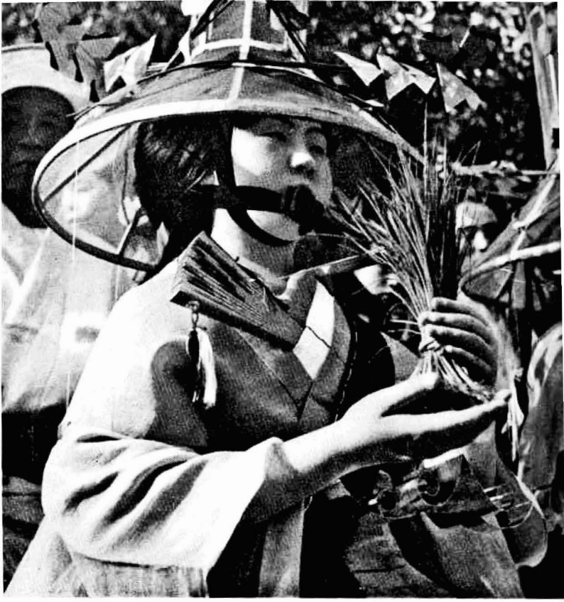
The shoots being planted by farmers in festive costume

The geisha girls do a solemn dance before passing on the shoots of rice to the farmers