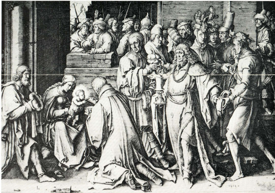
THE ADORATION OF THE MAGI