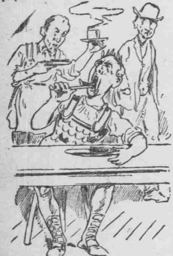
Caesar conciliating the common people.

Caesar's daughter, Julia, who became the wife of Pompey, afterward died, and a coolness sprang up between Pompey and his father-in-law, for Pompey was a leader of the aristocracy, while Caesar ate pie with his knife in order to conciliate the common people.