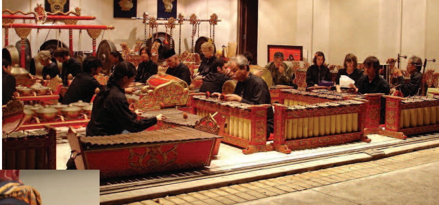
JAVANESE GAMESAN, HGS

Limited seating; tickets available at UHM Campus Center Box Office (M-F 8:30-4:30) from gamelan members, and at the door. Tel. 944-7177 to reserve tickets, which must be claimed by 15 minutes before performance.