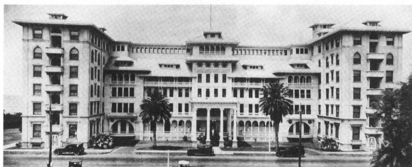
FIG. 2. The Moana Hotel was completed in 1901. Two wings were added in 1918 to create this facade. The hotel was completely renovated in 1989, is currently operating, and is listed in the Hawai'i State and National Registers of Historic Places.

All property, buildings, equipment, tools and other materiel owned or operated by the above named firm and located in the City of Honolulu, T.H., including all property at the following location: 2353 Kala-kaua Avenue.