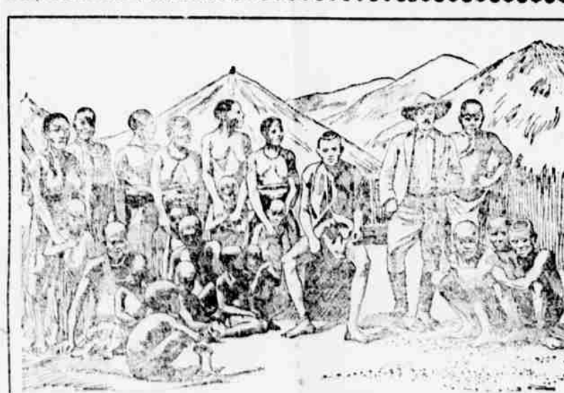
A GOLD HUNTER AND ASSISTANTS IN RHODESIA