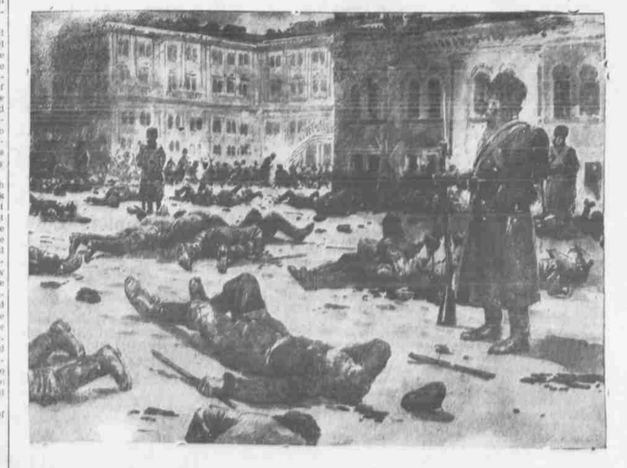
This is the bivouac of the Imperial Guard at the point where the Nevsky Prospect opens into the square of the Winter Palace. It shows the famous corner a few minutes after the first firing upon the troops by the soldiers. The picture is the work of a German artist who witnessed the scene. He immediately left for Berlin, where he painted this picture and forwarded it to America.