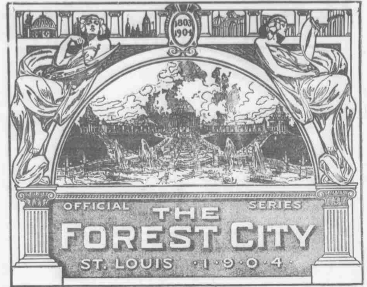
(Reduced Pen Sketch of Cover. Size of Page, 11x14 inches.)

SO THOROUGHLY does this Great Exposition represent the world's civilization that if all men's other works were, by some unspeakable catastrophe, blotted out, the record here established would afford a necessary standard for the re-establishment of our entire civilization. And, just as the Louisiana Purchase Exposition held within its gates an epitome of the civilization of to-day, so the Forest City Portfolios are a complete record and reflex of the great Exposition. This great World's Fair, one of the most remarkable undertakings in the history of American civilization and progress, will inspire many pens, but no history of the great event can compare with the one written on the grounds by Secretary Stevens and illustrated with 480 magnificent photographic reproductions, which transfer the Exposition to the printed page.