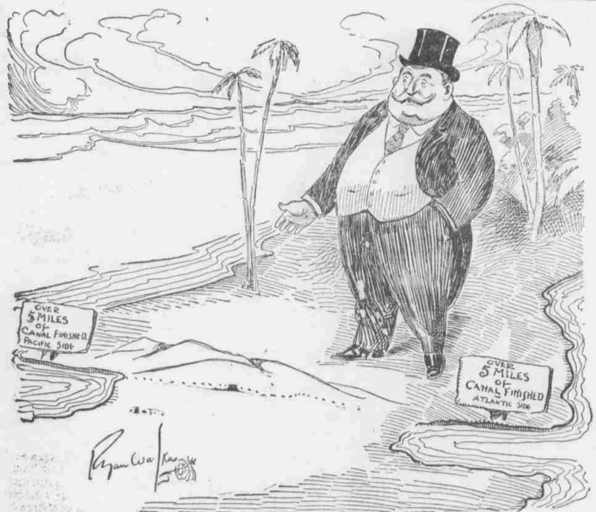
WHEN THE PRESIDENT VISITS PANAMA.

Over ten miles, the amount of work finished on the Canal by November.—News Item.