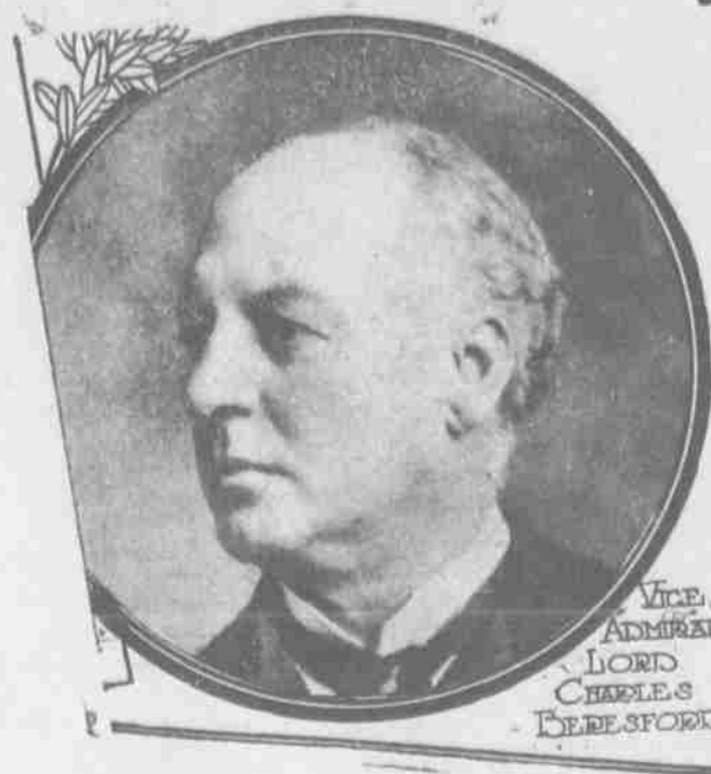
VICE ADMIRAL LORD CHARLES BERESFORD

"Well, you take two thick slices of chicken, a slice of roast beef and a raw tomato. Then you add some lettuce and sauce." "That's a queer mixture, pardner, but I guess our chef can make it." Five minutes later he returned from the kitchen with the "white-cap sandwich" and the shabby individual devoured it to the last crumb. "That was pretty good, mister," he remarked, rising from the table. "That so? But how in the world did it get the name of 'white cap' sandwich?" And then the shabby individual "beat it." "Why, you see, boss, it is always on the chef." And then the shabby individual "beat it."—Chicago News.