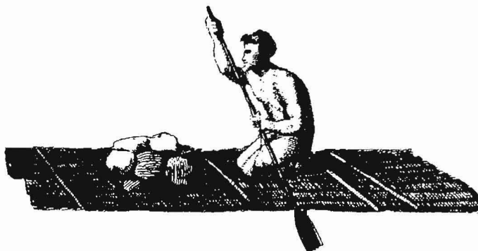
Society Islands raft. "Art of Captain Cook Voyages" vol. I, Joppien and Smith, plate 28, 1985.

Yap were fashioned on one of the small islands of Palau (Babelthuap), located more than 600 km away. The smaller disks (with a diameter between 3 and 3.65 meters) were taken out by canoes whereas the larger, or considerable weight, were taken on rafts. "... but also on river rapids."