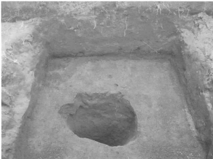
Figure 2. Test trench 1, sqm 2, with feature 6 (vegetational pit or posthole) and burnt area.

resume excavations in the vicinity of Mulloy's excavation (Trench 22) (Mulloy 1961:146). Our goal was to investigate whether other cultural remains were to be found at the same level as Mulloy's charcoal lens, and if the activities were tied to the ceremonial site or to an earlier human activity at this site.