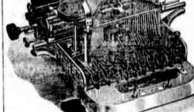
Before Buying a Typewriter, see the

A TWO-MANUAL and Pedal Bass REED ORGAN Music Co., Fort street. 1267