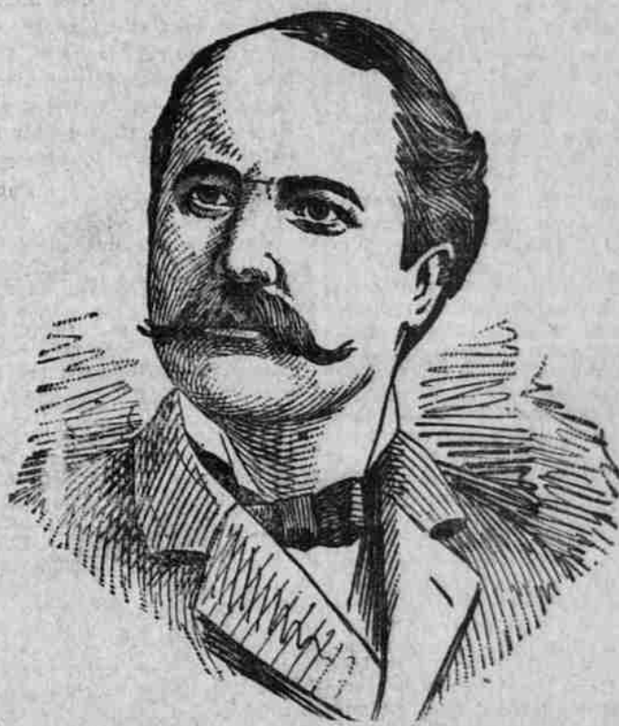
WILLIAM M'KINLEY OF OHIO AND GARRETT A. HOBART OF NEW JERSEY WHO WERE ELECTED PRESIDENT AND VICE-PRESIDENT OF THE UNITED STATES ON NOVEMBER 3D.

ern, Central and some of the Southern States. A great Republican majority in the next House of Representatives is assured, probably also in the Senate.