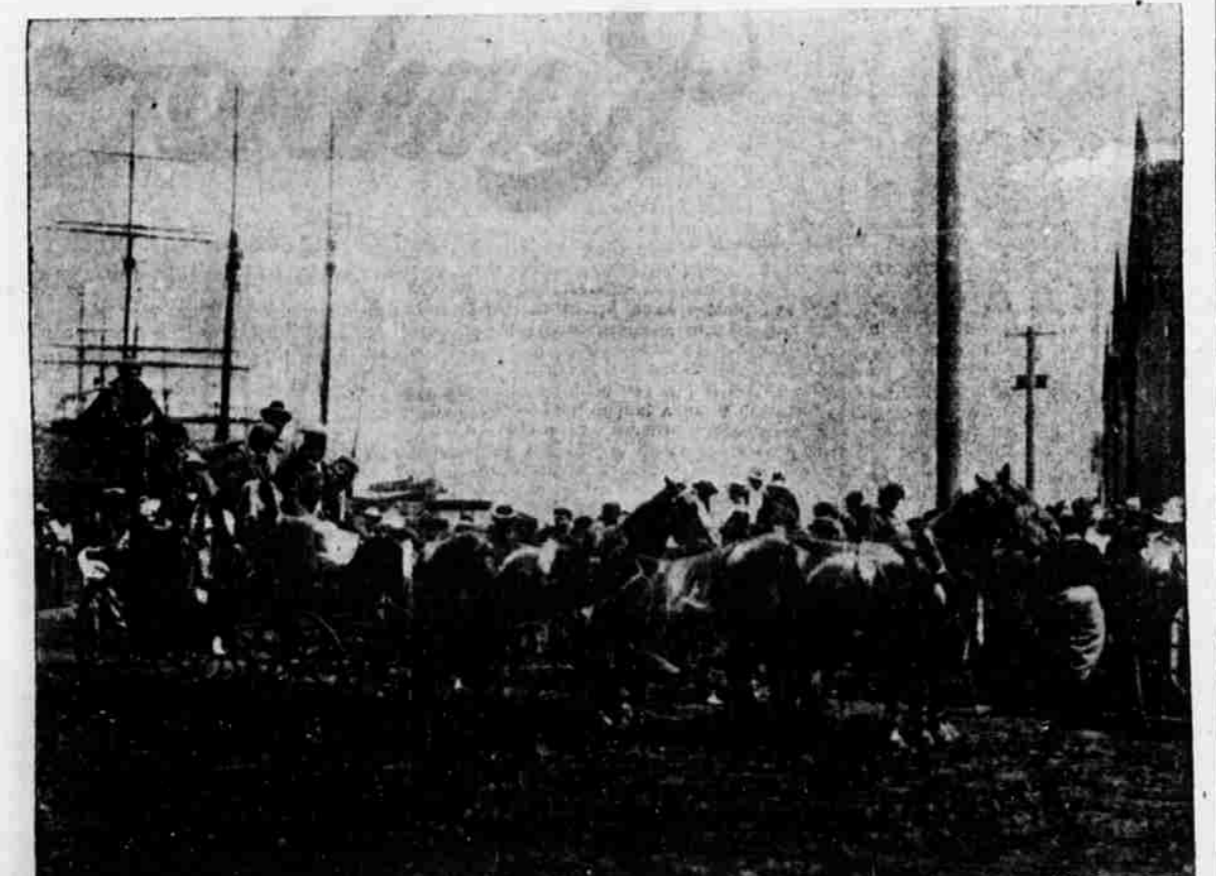
AUSTRALIA DAY IN HONOLULU.