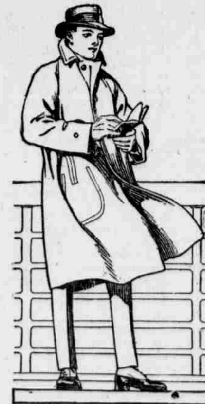
Copyright Hart Schaffner & Marx

Agents for Hawaii. 74 Queen Street, Honolulu, T. H.