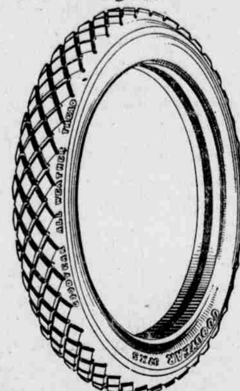
NAWILIWILI GARAGE, Agents for Kauai.