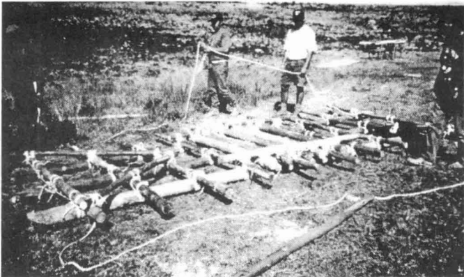
The V. R. Lee sled under construction.

Having arrived at this solution, I made a small model to illustrate the idea to NOVA and suggested we substitute a full