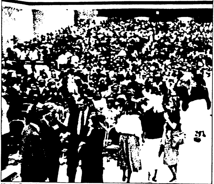
Virginia Beach, VA Election Headquarters