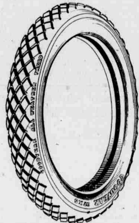
NAWILIWILI GARAGE, Agents for Kauai.