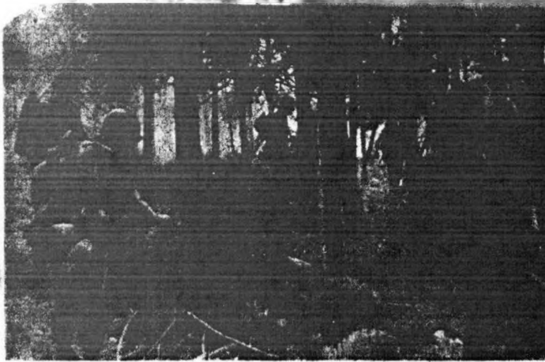
Into woods like this fought Japanese-American troops Monday, pushing their way against fantastic resistance to the rescue of their GI comrades, of the 1st Bn, 141st Infantry, surrounded by the German enemy who was determined to destroy them.