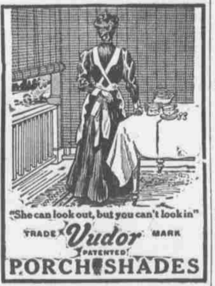
"She can look out, but you can't look in"

They are artistically stained in soft, pleasing colors. These colors are