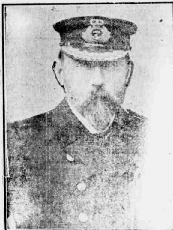
ADMIRAL SIR RICHARD POORE.

Peasant women at great personal risk distributing refreshments to Belgian soldiers in the trenches. (Note bomb proofs in side of trench.)