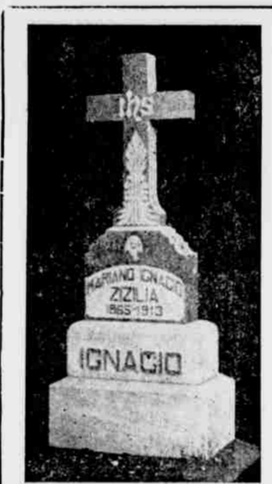
HONOLULU MONUMENT WORKS, Ltd. P. O. Box 491 Honolulu.

has died out of the people of today, but you will yet find an old man. The piles of bones along the beach give their mute testimony that there were a great many. There are more than a man would care to count in a day. But the Kauai warriors, too, are dead. Their spirit whose eye will twinkle with a strange light when he tells you that Kalaipahoa fled to Kawaiahae because of the fierceness of the Kauai warriors, inspired by the war god of Kauai.