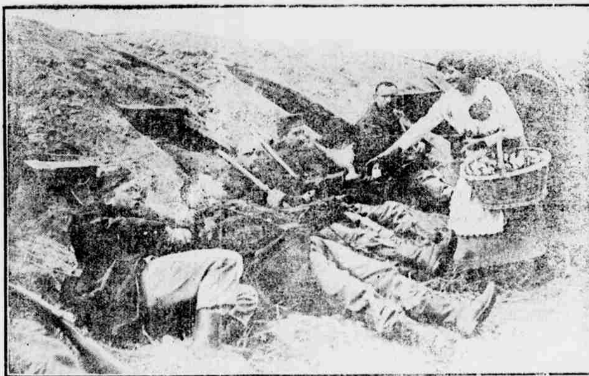
WOMEN RISK LIVES TO BRING "GOODIES" TO SOLDIERS IN TRENCHES.

The lower photograph shows a German supply column making its way to the German base of supplies.