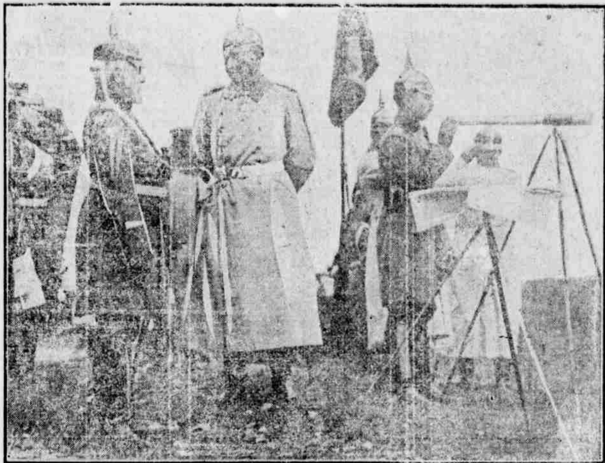
KAISER KEEPS IN CLOSE TOUCH WITH HIS MEN IN THE FIELD.