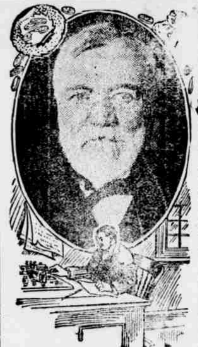
ANDREW CARNEGIE The Man Who Saved

grew rich because he always planned to have a little money put aside when opportunities for investments were offered. How much have you put aside? Nothing? Better get started right now.