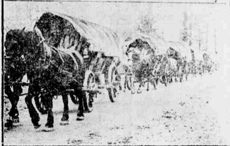
TWO INTERESTING SCENES IN THE GERMAN ARMY.

Upper photograph shows German soldiers guarding an outpost in East Prussia near the Russian border, passing the time by studying war pictures.