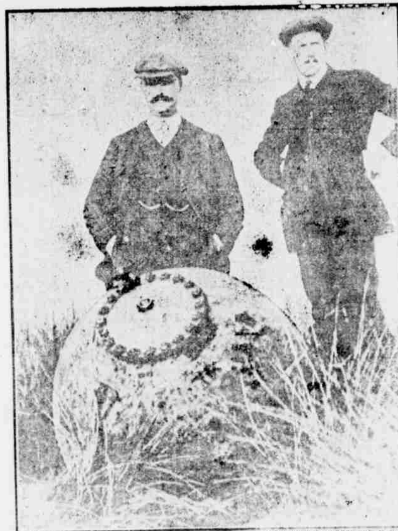
HERE IS WHAT A MINE LOOKS LIKE: HUNDREDS OF THEM ARE FLOATING IN THE NORTH SEA

Commander of the Second Squadron of His British Majesty's Navy.