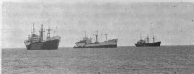
The MS Muskingum, the MS Gunners Knot and the MS Herkimer at anchor in the Tanapag harbor.